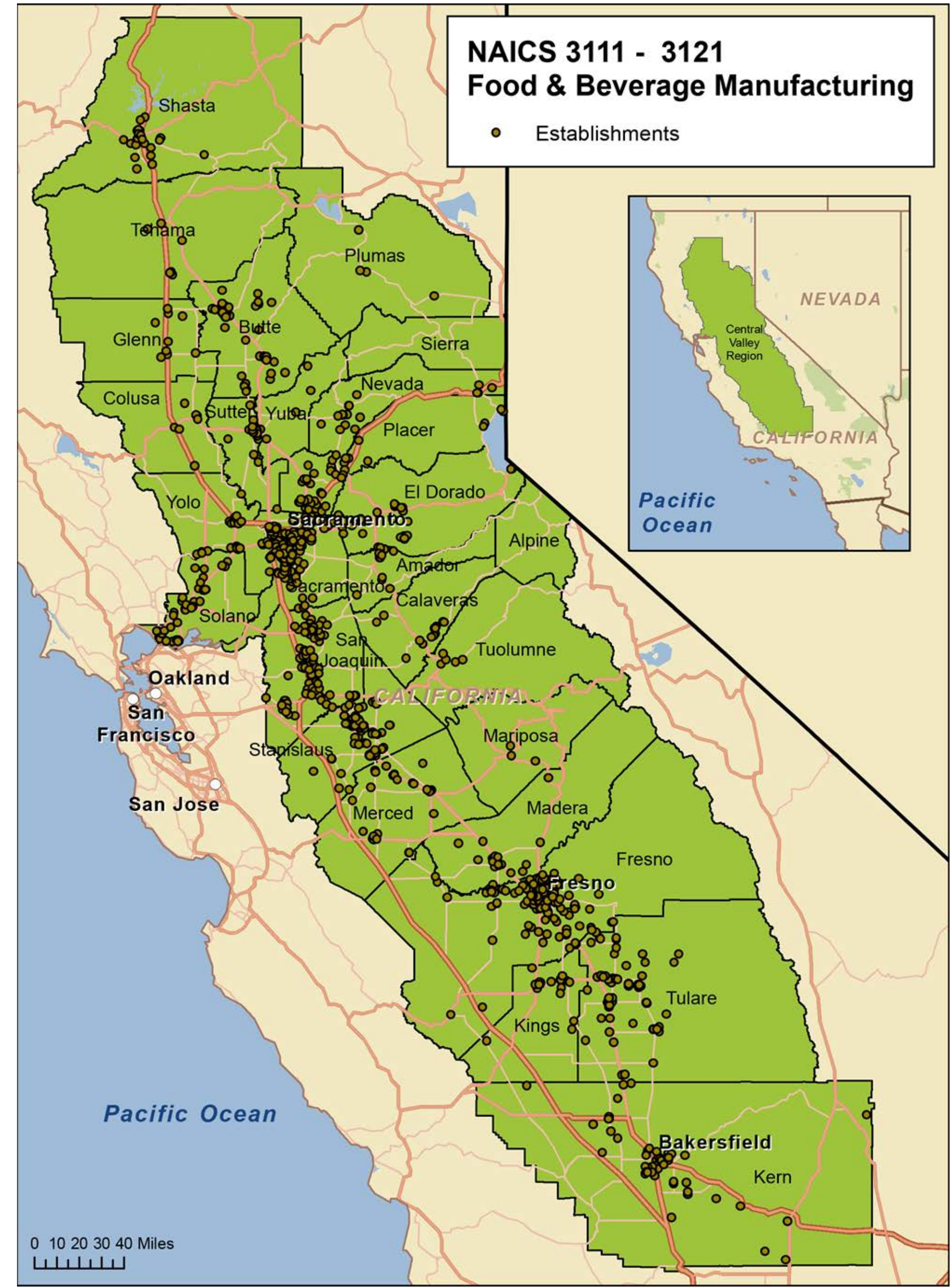
Graph above: Regional Food and Beverage Manufactures. This graph represents the significant presence of agricultural manufactures within the San Joaquin Valley.