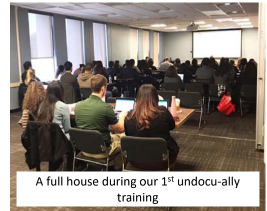
A full house during our 1 st undocu-ally training