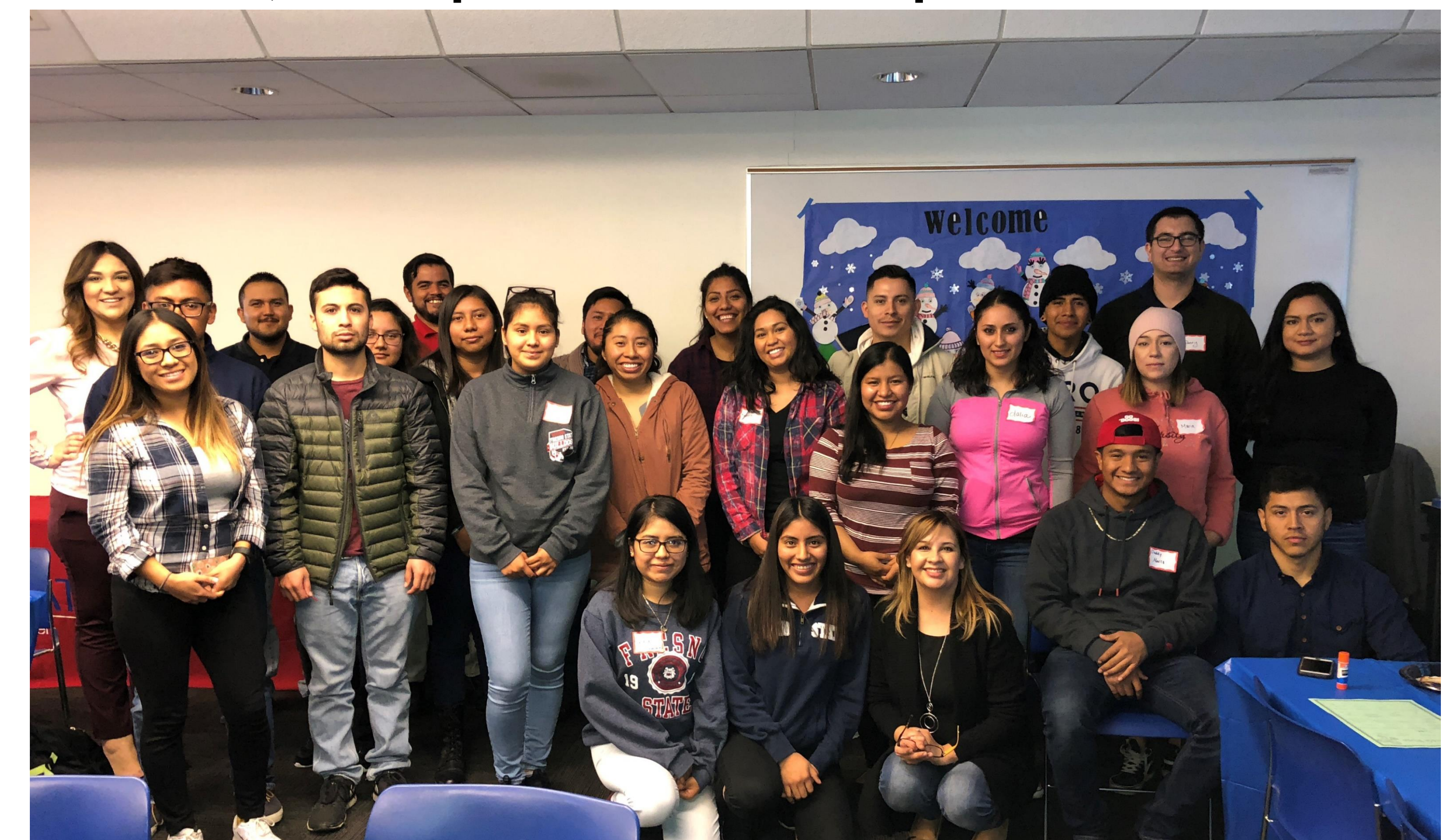
2017 Winter Celebration with students – A Time to Build Community

Through Fresno State's support, Dream students received over $300,000 in private scholarships